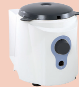
Cryolys® for sensitive molecules