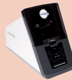
Minilys® for personal use